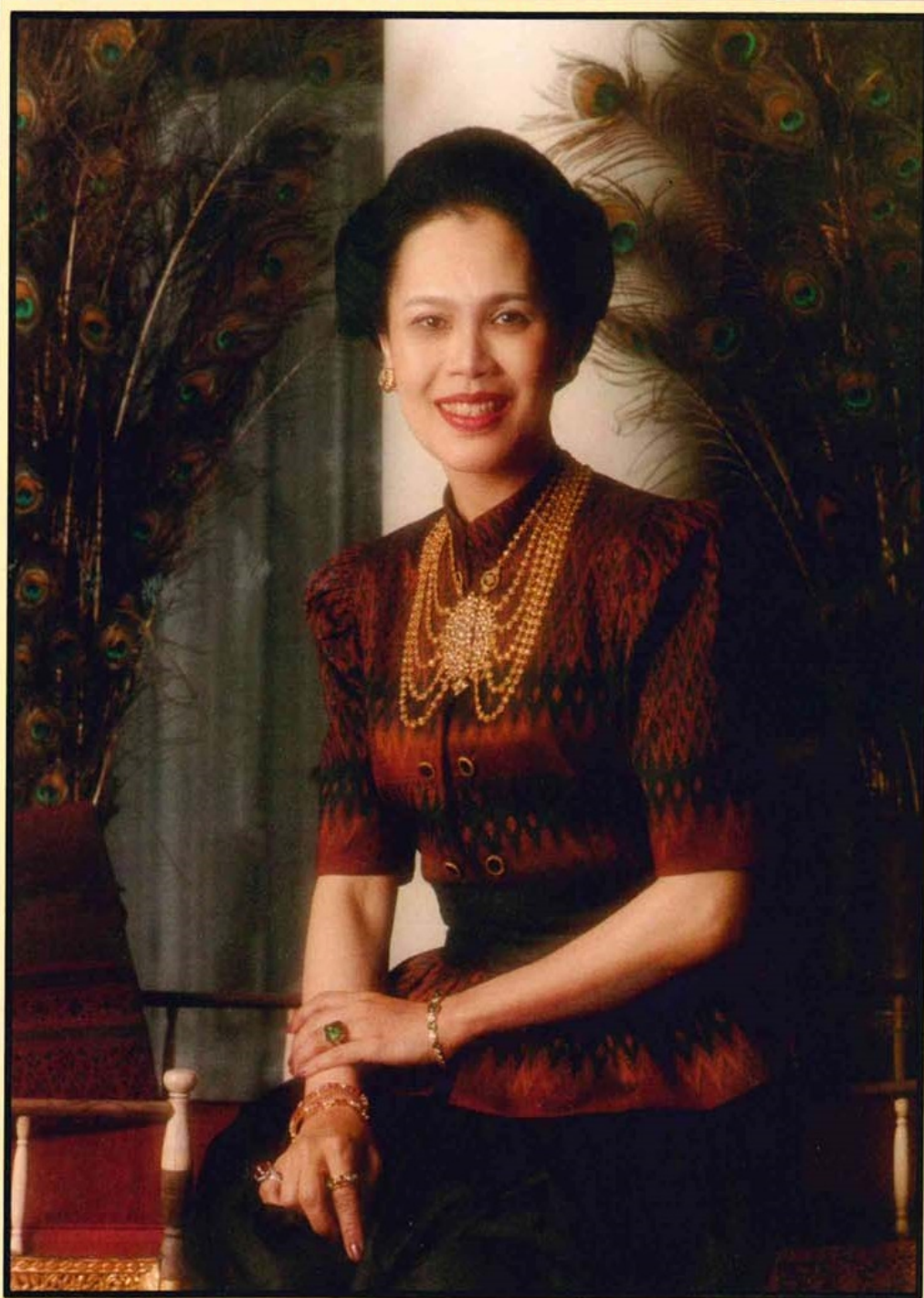
HER MAJESTY QUEEN SIRIKIT OF THAILAND FOUNDER, THE ROYAL SUPPORT FOUNDATION